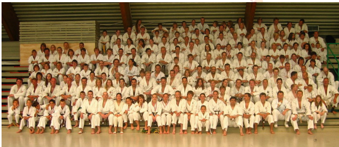
Last years participants